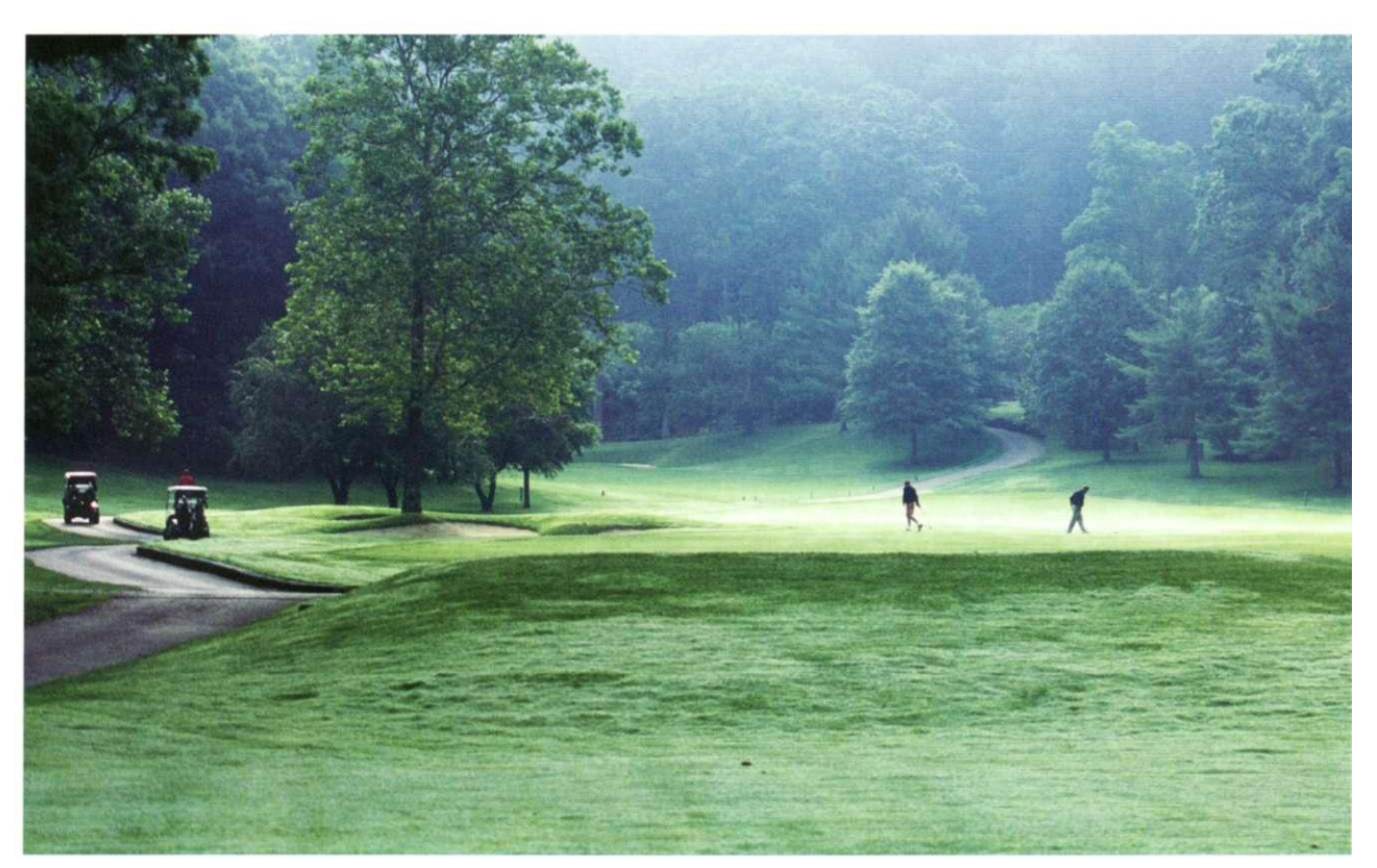
Members at the Greenbrier Sporting Club can access the golf courses and other facilities at the Greenbrier resort (above and below).

amenities include a golf clubhouse and an oceanfront beach club outfitted with water sports gear.