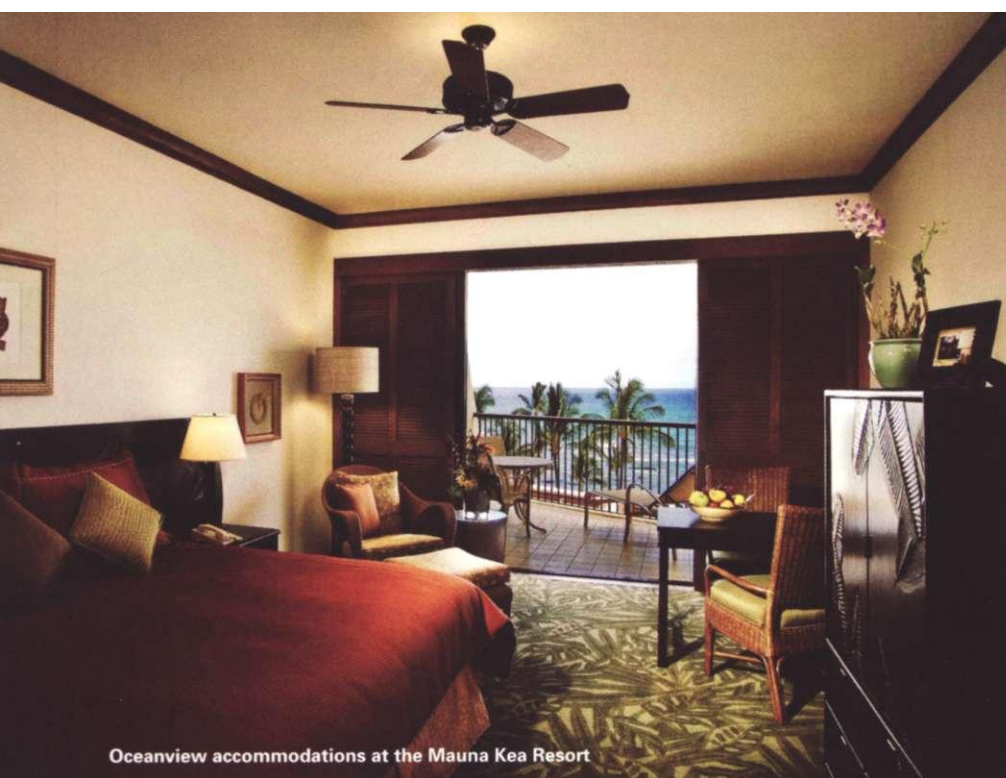
Oceanview accommodations at the Mauna Kea Resort